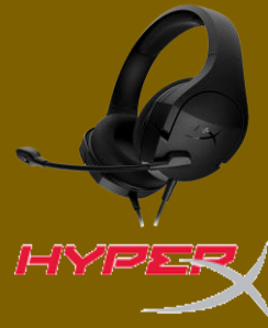
Stinger core PC Headset