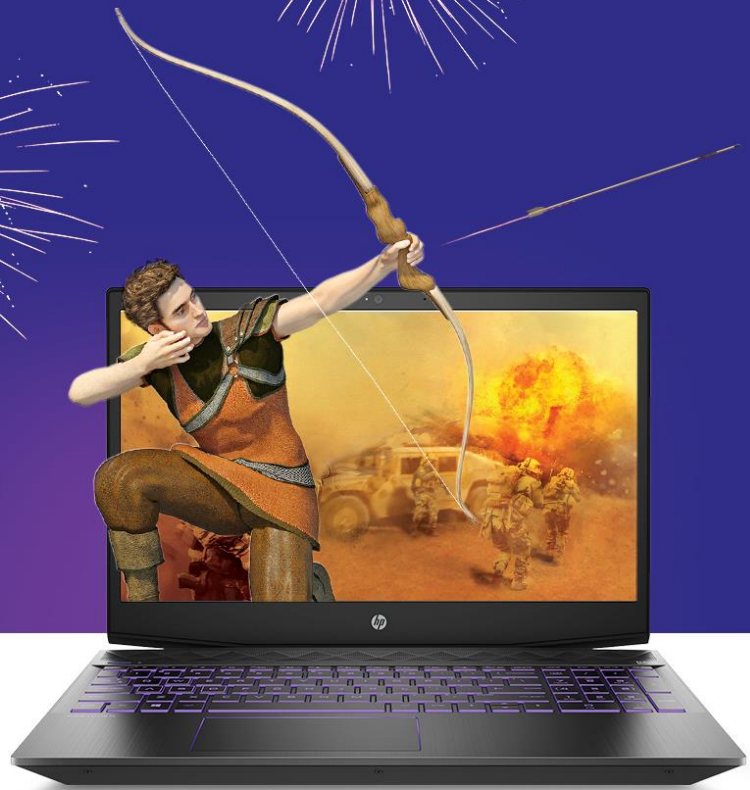
HP Pavilion Gaming Laptop 15-cx0144TX

The latest HP Pavilion Gaming Laptop is all you need to have a cracker of a Diwali. With such amazing graphics and performance, you are bound to get fireworks.